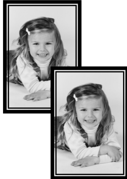
B – 2-5x7's