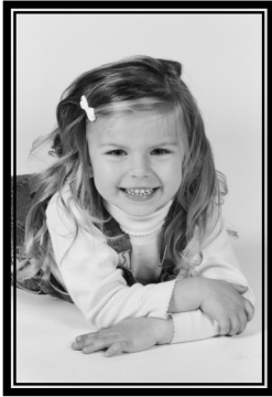
A – 8x10